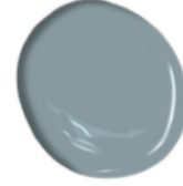
Benjamin Moore Waters Edge

Paint colors in Coastal design are usually whites and neutral and can include some blues and navy