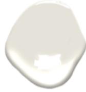
Benjamin Moore Classic Grey