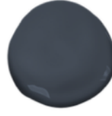
Benjamin Moore Hale Navy