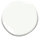
Benjamin Moore Chantilly Lace