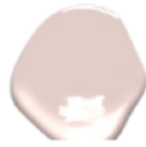
Benjamin Moore Pale Cherry Blossom