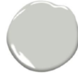
Benjamin Moore Stontington Grey

Paint colors in Coastal design are usually whites and neutral and can include some blues and navy