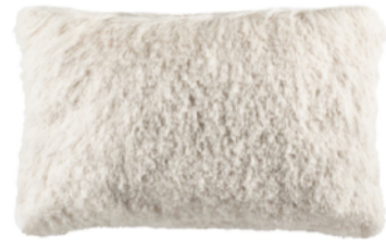
Shaggy in Any Color