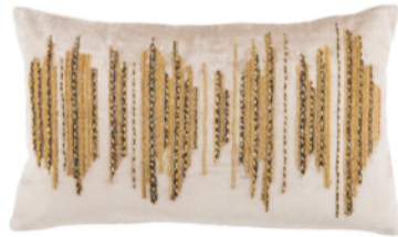
Velvet & Beaded