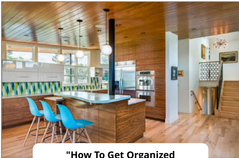
"How To Get Organized To Create a Room You'll Love"