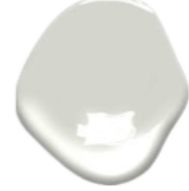
Benjamin Moore Grey Owl

Popular Modern Farm House paint concepts are dark and moody jewel tones and pops of blue orange and mustard.