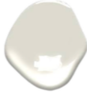
Benjamin Moore Light Pewter