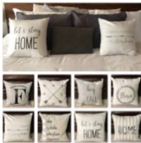
Monograms & Phrases