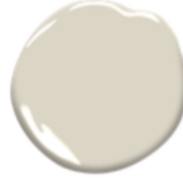
Benjamin Moore Edgecomb Gray