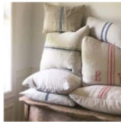
Grain Sack & Ticking Stripe